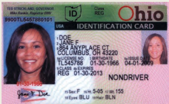
State Identification Cards